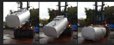
DROP TESTED AS REQUIRED UNDER ADR