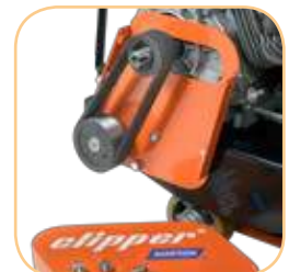
Pulleys with removable hub and Poly V belts.