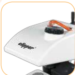
Easy removal of water tank.