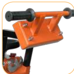
Handlebar equipped with vibration absorbers.