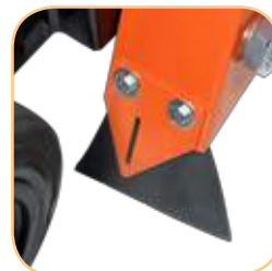
Rear cutting guide.